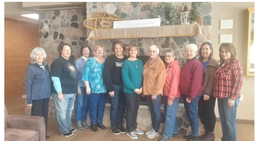
TLC Women at the WOW retreat

Our next meeting is May 13, 2023, at 10:00am! Please join us for fellowship, support of our sisters and our church, and planning future events!